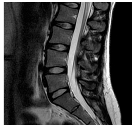
Figure 3. MRI of the lumbar spine.