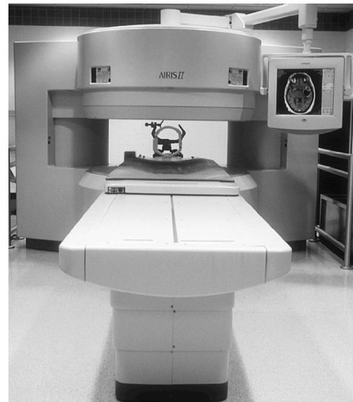
Figure 5. Viewed from the front, an open MRI resembles a bagel more than a donut, allowing the person being scanned more room.