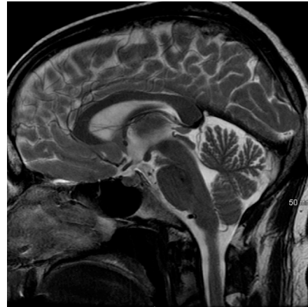
Figure 1. MRI of the brain.

MR angiogram (MRA). MRI can be used to view arteries and veins. Standard MRI can't see fluid that is moving, such as blood in an artery, and this creates "flow voids" that appear as black holes on the image. Contrast dye (gadolinium) injected into the bloodstream helps the computer "see" the arteries and veins. Contrast is also used to view tumors and arteriovenous malformations (AVMs).